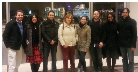
Members of the Board of Directors from SRUK/CERU and PARSUK met at the Royal Festival Hall in London.

20 th November 2012. SRUK/CERU met with representatives of the Portuguese Association of Researchers and Students in the United Kingdom (PARSUK) to share experiences and opinions. PARSUK was established in 2008 and annually organises the LUSO symposium for its members. SRUK/CERU and PARSUK explored ways of collaboration to crystallise during 2013: web links, joint events, funding partners, and sharing costs for any collaborative effort.