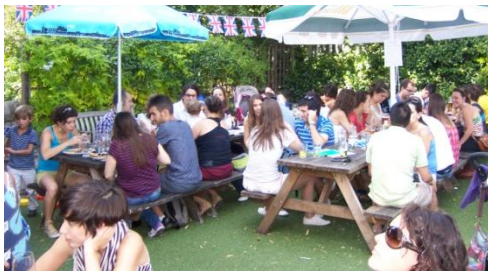
More than 60 attendees to the I BBQ SRUK/CERU enjoyed networking under the British sunshine.

9th September 2012. SRUK/CERU bade farewell to summer on a splendid day. The members of the Cambridge Constituency organised a successful social event with over 60 attendees, who discussed about the aims of the Society, the future events, and many scientific-related topics.